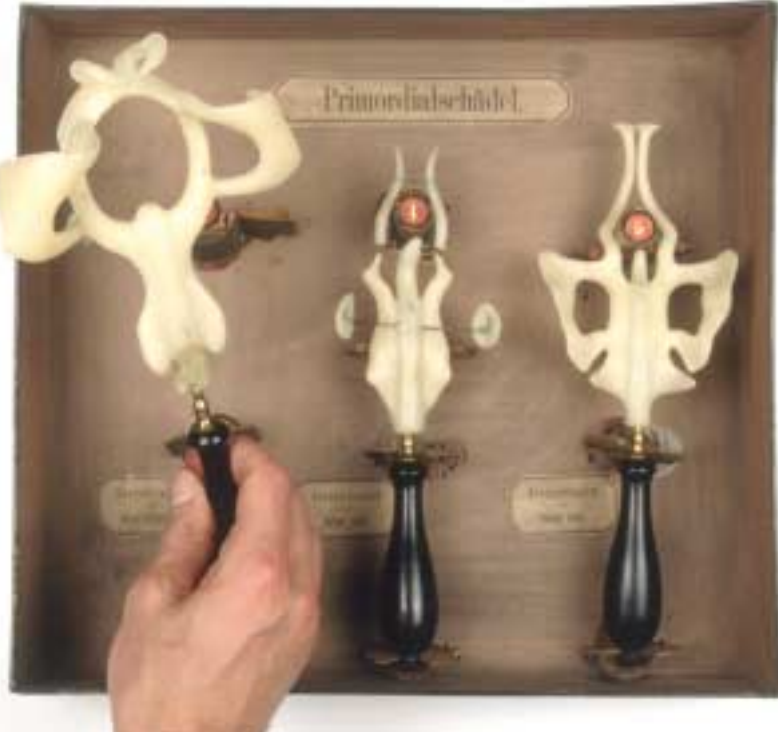
Plate 15. Development of the primordial skull by Adolf Ziegler after the plate models of Philipp Stöhr, 1882 ( series 15 ). The skulls are of the axolotl, Siredon pisciformis (models 1 and 2); frog, Rana temporaria (3); and salmon, Salmo salar (4 and 5). The models magnify about 100 times, and are 15–19 cm long (without handles). University Museum of Zoology Cambridge.